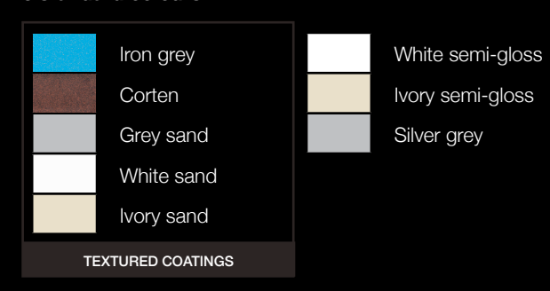
Optional: All RAL colours and a wide choice of textured coatings